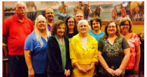
Volunteering at a SDAD fundraiser event.