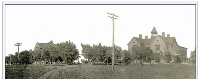
Telephone poles and overhead lines installed along the front of the building reflect the arrival of modern communication systems serving the school.