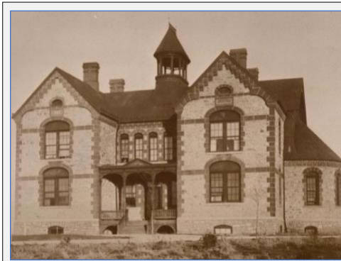
One of the earliest known photographs of the Main Building, taken shortly after stucco and exterior paint were applied in 1885. The image shows the original roof cupola, which was later removed during modernization work in the 1930s.

These elements reflected late-nineteenth-century institutional design and helped establish the architectural identity of the SDSD campus.