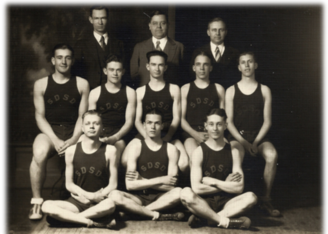
The 1928-29 Basketball Team

The South Dakota Advocate April 1929 Vol 27 No. 7 p. 1 (Photo not use)