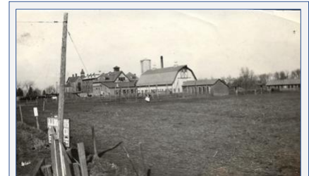
Expanded SDSD farm acreage and facilities following the 1917 land acquisition under Superintendent Howard Simpson.

A major expansion of the SDSD farm occurred during the administration of Superintendent Howard Simpson. In 1917, an additional 109 acres of land were acquired following legislative approval, significantly increasing the size and capacity of the farm. Simpson played a key role in expanding and modernizing the farm into a more advanced agricultural operation. Improvements during this period included the construction of a large modern barn, additional livestock facilities, and a round concrete silo. The expansion reflected Simpson's interest in strengthening agricultural education, particularly as many students came from farming backgrounds. The farm eventually reaching approximately 125 acres under cultivation and educational.