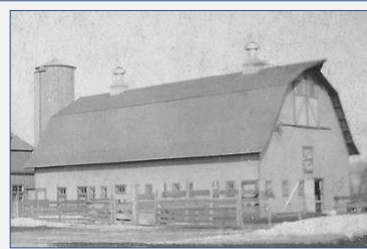
Main SDSD farm barn, central to livestock care and daily operations.