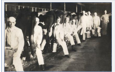
SDSD pupils posed with dairy cows during milking, reflecting hands-on agricultural training.

At the time, agricultural labor was considered an important component of practical education and character development.