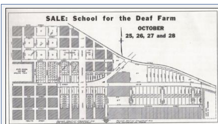
Map showing subdivision of the SDSD farm into approximately 170 individual lots for public auction in October 1949. The land was organized into blocks and tracts to support residential and urban development.

In 1949, the South Dakota Legislature authorized the sale of the SDSD farm as part of a broader shift in educational priorities and financial management. State officials determined that the farm was no longer economically sustainable, noting that it was being operated primarily by hired labor and was not producing sufficient returns.