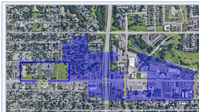
Approximate area of the former SDSA farm overlaid on the modern Sioux Falls aerial map.

The transformation of the land—from working farm, to school athletic grounds, to a modern community support center—reflects the broader transformation of both the school and the city of Sioux Falls over time.