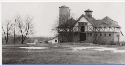
Final day of original barn was photographed by Renee Knochenmus before being dismantled.

The land sale generated strong interest, with bids frequently exceeding appraised values. Initial sales brought in approximately $17,000 on the first day, with additional sales raising further funds. In total, the land sale produced approximately $78,000.