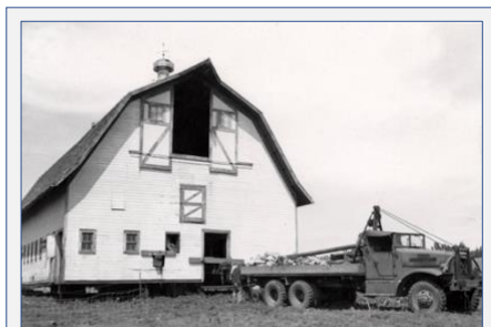
The main SDSD farm barn being relocated in 1949 to the east side of Sioux Falls, near Sycamore Avenue and 6 th Street. The structure remained in use until it was removed in the 1990s for construction of Washington High School.

The final phase involved the sale of the farmland itself. Approximately 113 to 115 acres were subdivided into blocks and roughly 170 individual lots. These parcels were offered at public auction over several days in October 1949 under the supervision of state officials.