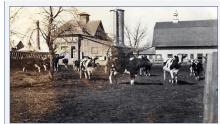
Dairy herd at SDSD, contributing to the school's food supply and farm income.

By the early 20th century, the farm had reached its greatest extent, covering approximately 145 acres, with about 125 acres actively farmed. The land extended across a large portion of what is now eastern Sioux Falls, forming a significant agricultural presence adjacent to the school campus.