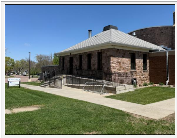
Present-day view of the former Boiler House, now part of the Empower Campus, with modern ADA Accessibility improvements, concrete ramps and updated lobby facilities.

When the gymnasium addition was constructed, athletic locker rooms were originally located beneath the grandstand seating area. During the late 1960s or early 1970s, those locker rooms were removed and replaced with wooden movable bleachers.