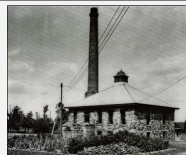
Boiler House and smokestack shortly after construction, circa early 1900s. The building provided centralized steam heat for the growing SDSA campus.